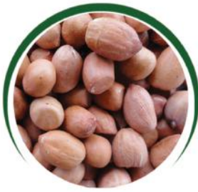
INDIA Java- Raw Raw: (50/60, 60/70, 80/90, 90/100)