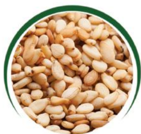
INDIA Natural Sesame Seeds