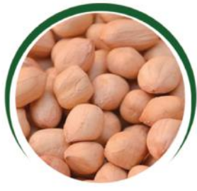
USA Spanish (Jumbos, Mediums)