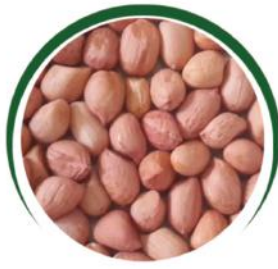
INDIA TJ Raw Raw: (50/60, 60/70, 80/90, 90/100)