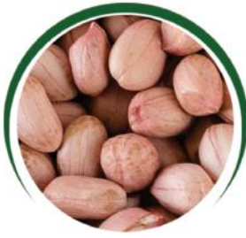
ARGENTINA Runner (High Oleic) (38/42, 40/50, 50/60, 60/70, 80/100, Splits)