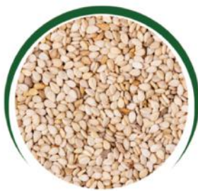
PARAGUAY Natural Sesame Seeds