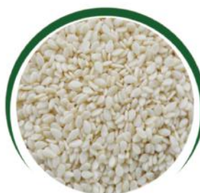
INDIA Hulled Sesame Seeds