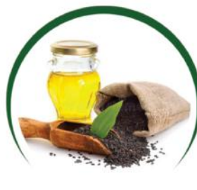
Crude-Refined (BP/USP/EP Grades)