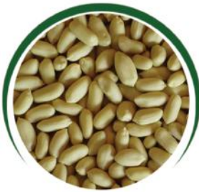
INDIA Bold-Blanched Raw: (38/42, 40/50, Splits)