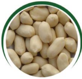
USA Runner - Blanched (Jumbos, Mediums, Splits)