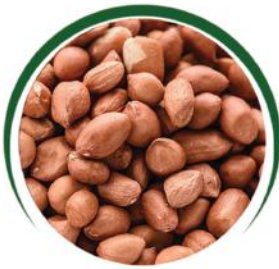
BRAZIL Runner-Raw (38/42, 40/50, 50/60, Splits)