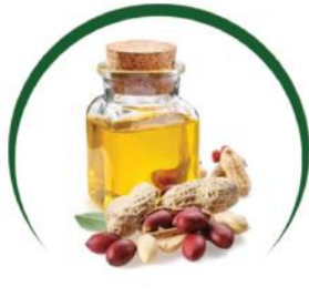
Crude & Refined (BP/USP/EP Grades)