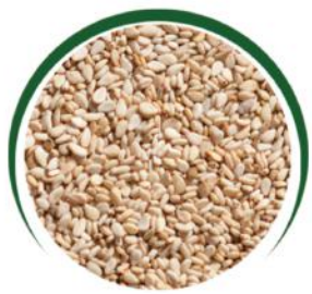
ARGENTINA Natural Sesame Seeds