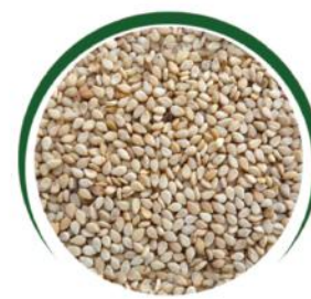
BRAZIL Natural Sesame Seeds