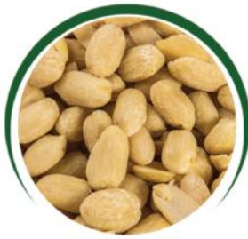
BRAZIL Runner-Blanched (38/42, 40/50, Splits)