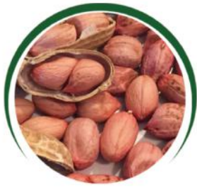
USA Runner-Raw (Jumbos, Mediums, No#1, Splits, 14/16)