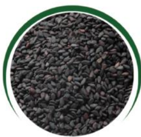
INDIA Black Sesame Seeds