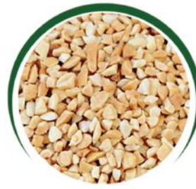
BRAZIL Runner-Chopped (2-4 mm, 4-6 mm)