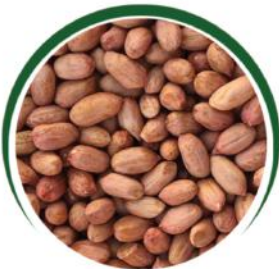
INDIA Bold Raw (38/42, 40/50, 50/60, 60/70, 70/80, Splits)